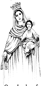
Our Lady of Mount Carmel